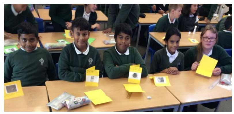
History: WWII - taking on the role of a museum curator

Please do have a look on our website to see more examples of learning experiences and the written work completed.