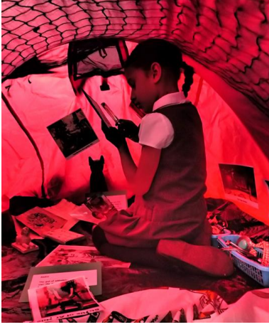
History: Ancient Egypt - discovering a tomb