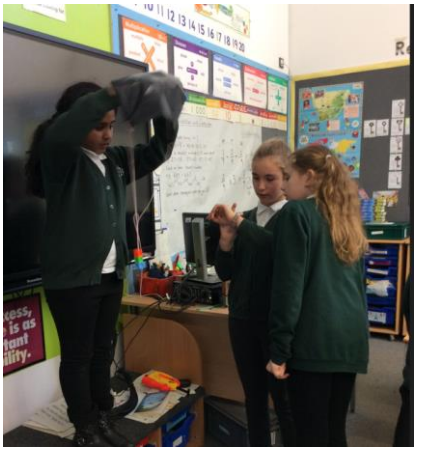
Science: air resistance- parachutes